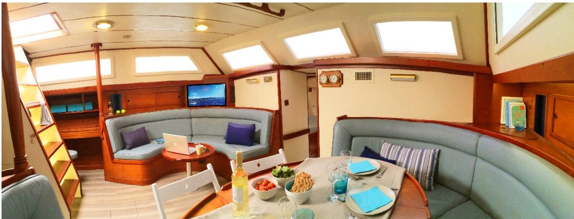
Saloon: double space in leather and mahogany