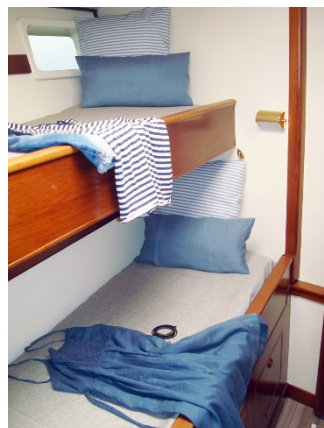
Bunk bed cabin