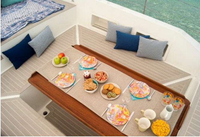
Double cockpit: Privacy and comfort for the guests

Classic main sail, furling genoa and foresail, electrical winches, electronic Raymarine, air conditioning/heating, generator and inverter, water maker 100 l/h, Wifi, sound system, TV/DVD in saloon and main cabin, dingy with outboard engine, paddle surf, kayak, snorkel, complete safety equipment, teak deck and teak cockpit with bimini, fully equipped galley: 2 freezers, 1 fridge, ice maker, washing machine/dryer, microwave, etc.