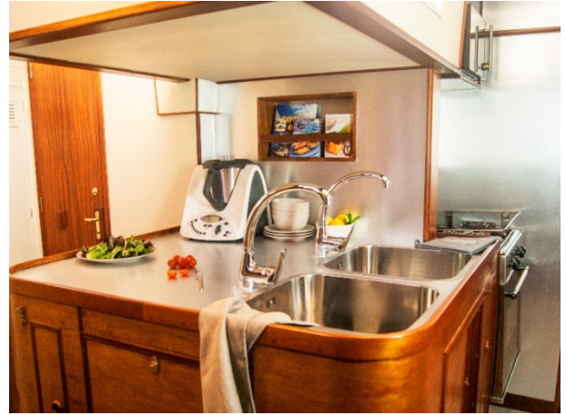
Galley: Enjoy a great gastronomic experience